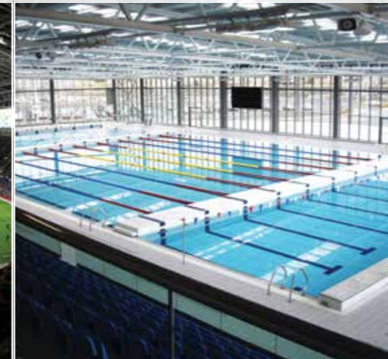
Cardiff International Pool