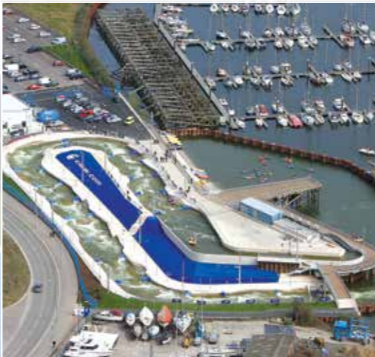
Cardiff International White Water