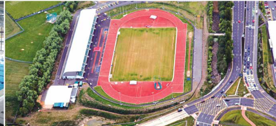
Cardiff International Sports Stadium