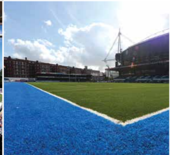
Cardiff Arms Park - 4G Pitch