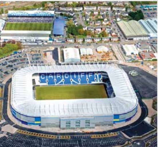
Cardiff City Stadium